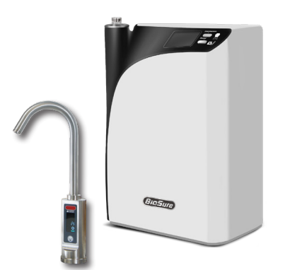
Motion-censer Faucet (optional)